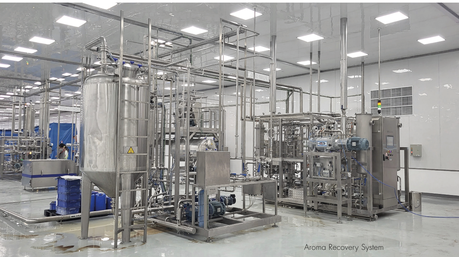
Aroma Recovery System